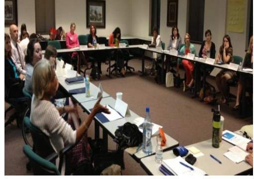
Youth Stakeholders Partnership Training

Employment: People with Intellectual Disabilities/Developmental Disabilities are given the education/training, knowledge, experience, accommodations and supports they need to achieve meaningful community- based employment